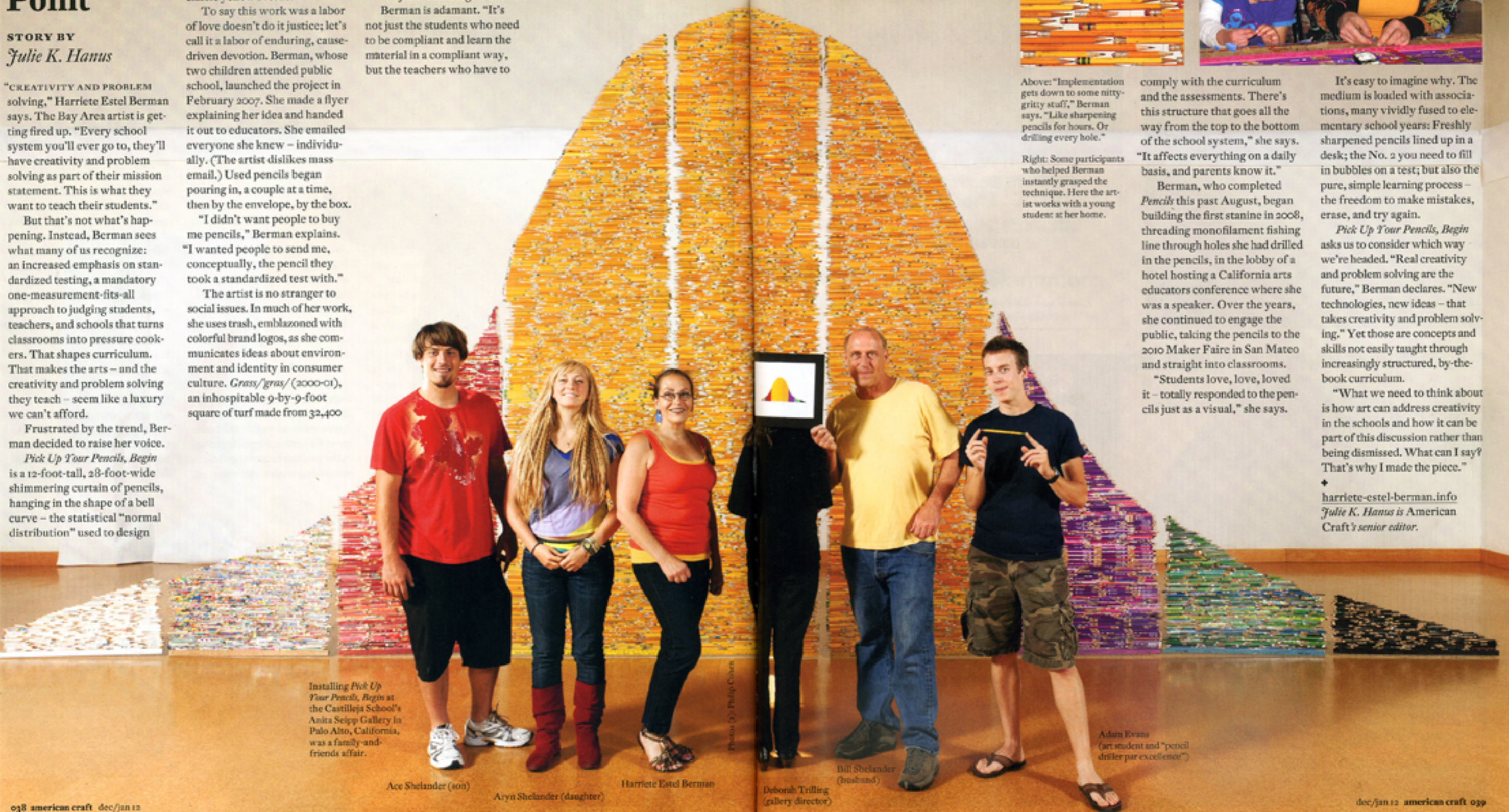
Installing Pick Up Your Pencils, Begin at the Castilleja School's Anita Seipp Gallery in Palo Alto, California, was a family-and-friends affair.